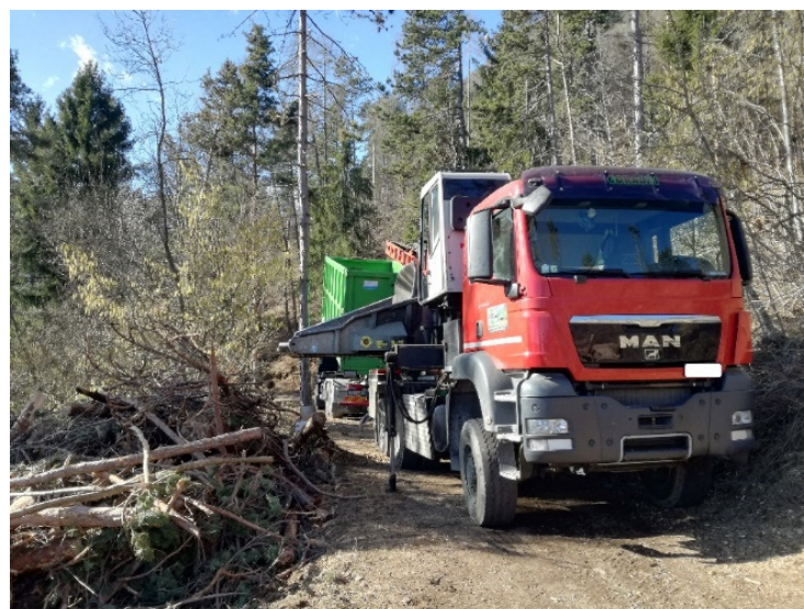
Figure 1. Mus-Max Wood Terminator 10 XL chipper-truck.

The chipper-truck was based on the chipper unit, a Mus-Max Wood Terminator 10 XL, mounted on a three-axles truck, a MAN TGS-28.540. The 397 kW truck's engine powered the chipper unit. Chipping operations were carried out by the operators seated in the external cabin (Figure 1). Net productivity declared by the manufacturer of the chipper unit is 180 m 3 /h. Details of the machine are reported in Table 1.