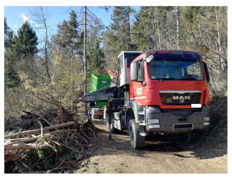
Figure 1. Mus-Max Wood Terminator 10 XL chipper-truck.

The chipper-truck was based on the chipper unit, a Mus-Max Wood Terminator 10 XL, mounted on a three-axles truck, a MAN TGS-28.540. The 397 kW truck's engine powered the chipper unit. Chipping operations were carried out by the operators seated in the external cabin (Figure 1). Net productivity declared by the manufacturer of the chipper unit is 180 m<sup>3</sup>/h. Details of the machine are reported in Table 1.